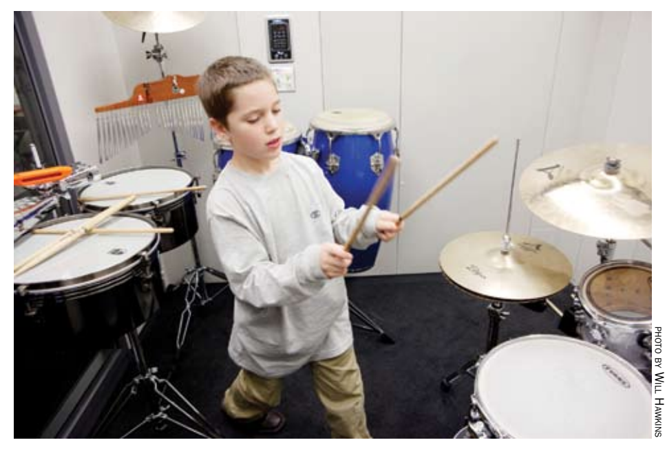
Wenger soundproof practice room at Rhythm! Discovery Center