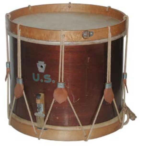
WFL rope-tension field drum

The federal government's Museum and Library Services Act defines a museum as: "A public or private nonprofit agency or institution organized on a permanent basis for essentially educational or aesthetic purposes, which, utilizing a profes sional staff , owns or utilizes tangible objects, cares for them, and exhibits them to the public on a regular basis." Indeed the next phase of development for the PAS museum and library is engaging a professional Development Director