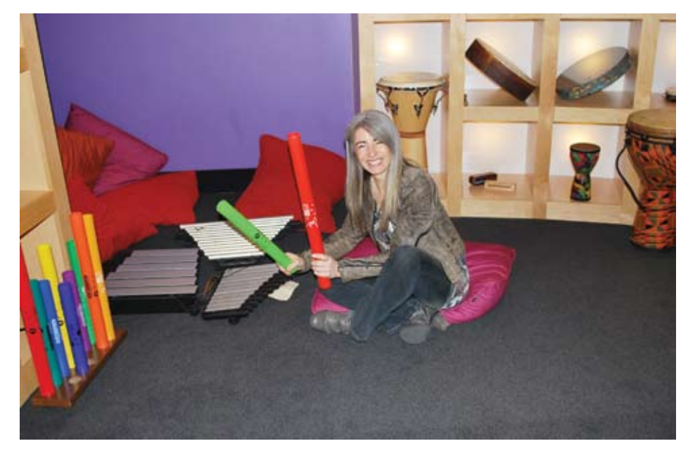
Dame Evelyn Glennie in the hands-on area at Rhythm! Discovery Center

With a growing collection of instruments and library materials, and an expanding PAS staff, the 13,000 total square feet of office and