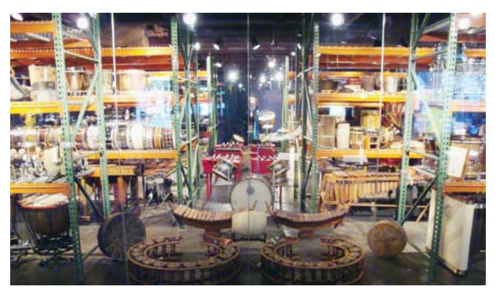
Storage room at Rhythm! Discovery Center

rare cylinder recordings and two machines to play them on (see December 2000 Percussive Notes article: www.pas.org/publications/publicationarchives/PercussiveNotesArchives/December2000PercussiveNotes.aspx and museum webpage: www.pas.org/experience/Gerhardt-Cylinder.aspx). The Fujii Database of Japanese Marimba Works by Mutsuko Fujii and Senzoku Marimba Research Group (www.pas.org/Learn/ FujiiDatabase.aspx) contains a downloadable survey of Japanese marimba pieces composed between 1929 and 2003. The Fujii Database Volume 2 contains a downloadable document entitled Evolution of the Japanese Marimba: A History of Design Through Japan's 5 Major Manufacturers (www.pas.org/Learn/Fujii Database2. aspx). A rare and unique exhibit of the Clair Omar Musser archives takes up one of the four special galleries in Rhythm! complete with number 97 of only 102 King George marimbas from