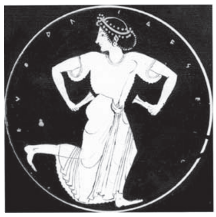
Greek Vase painting, Circa 5th century BCE, Maenad with Krotalas

The Greek word for frame drum, tympanon , is often translated as tambourine (frame drum with jingles), which is not necessarily accurate. It is not until approximately 250 C.E. that jingles are clearly depicted on the frame drum in Roman sculptures of Dionysian rites. Tympanon has also been translated as timpani,