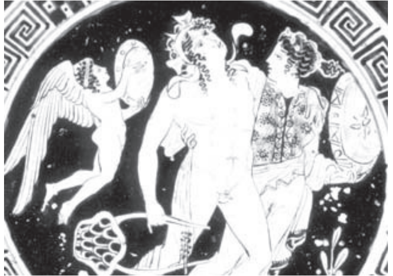
Greek Vase painting, Circa 5th century BCE, Eros, Dionysos and Ariadne

the frame drum and the women and men who participated in his rites were highly identified with the frame drum, krotalas, and cymbals along with the double flute. The military pyrrhic war dances set to frame drumming were also incorporated into the religious festivals and dramatic theater. This puts percussion at the root of the development of western theater. Knowing the widespread and ancient connection between drumming and dance forms, and that Greek dancers were highly identified with the frame drum, cymbals, and krotalas, it is hard to visualize Greek