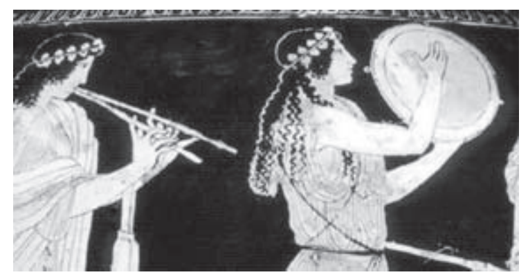
Greek Vase painting, Circa 5th century BCE, Maenad with Frame Drum

A majority of the frame drummers from ancient Greece appear to have been women, although there are more representations of male frame drummers on the vases than in any other ancient Mediterranean culture. The sculptural representations have primarily been of goddesses prominently holding or playing the frame drum. The frame drum appears to be the only drum of the ancient Greeks.